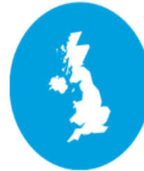
CONSTRUCTION TRAINING REGISTER

CITB Approved Training Organisations (ATO) need to add a learner's achievement to their training record on the Construction Training Register when they have completed a course.