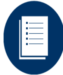
CONSTRUCTION TRAINING DIRECTORY